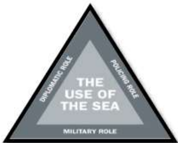
Figure 1. Trinity Roles