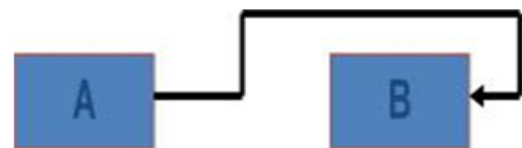
Fig. 6 Activity Relation of Finish-to-Finish (FF)