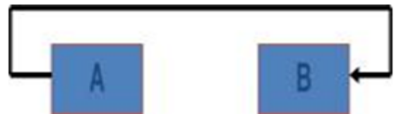
Fig. 4 Activity Relation of Start-to-Finish (SF)