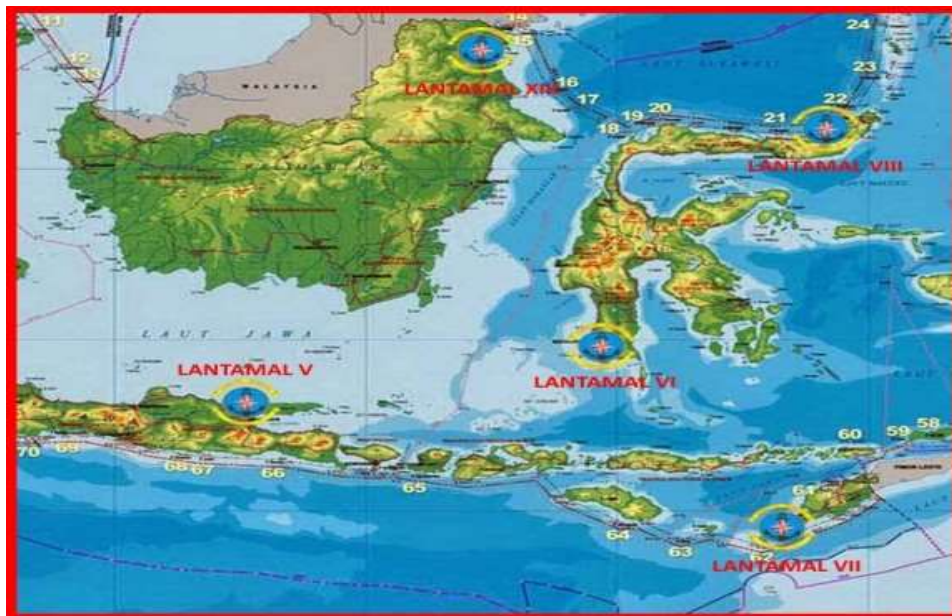
Figure 1. Map of the Koarmada II . area

resources; modernization of the KRI and development and improvement of facilities and infrastructure (Sarpras) of the Indonesian Navy (Rassa, AYKL, & Lestari, A., 2021)