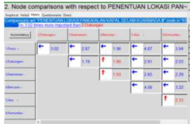
Figure 2. Pairwise comparison matrix between criteria

software. Pairwise comparisons are used to determine the value and relationship between criteria.