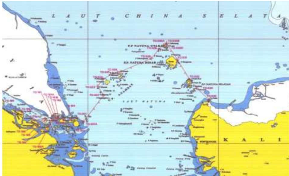
Figure 1. Ranai Region Map

The wealth of resources owned by Natuna is what eventually became an attraction for China, so that China made a unilateral claim to the Natuna islands. However, China's claim to the Natuna islands is not recognized by the United Nations. Through International Arbitration, the Nine imaginary lines formed by China do not have a strong enough basis to claim territory that is within the Nine imaginary lines. China's steps do not stop there, China has recently taken another step, namely by naming 80 islands and other geographical features in the South China Sea. This step is considered very brave considering that some of these islands are part of the sovereignty of the countries around the South China Sea.