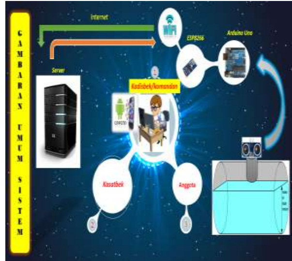
Figure 2: Overview