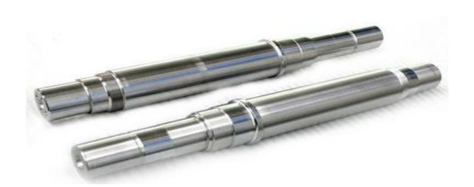
Figure 1. Shaft

d. Chain and Sprocket is one element of the machine that serves to transmit power (Power Transmission.