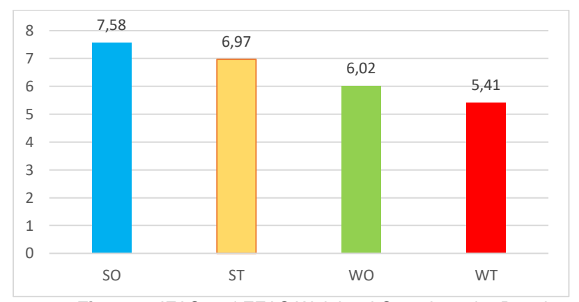
Figure 1. IFAS and EFAS Weighted Questionnaire Results

After determining the internal factors (strengths and weaknesses) and external factors (opportunities and threats), then determine the strategy for each aspect.