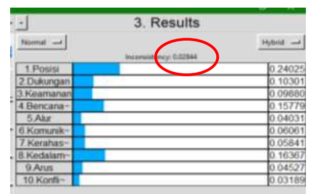
Figure 3. Criteria weight

In Figure 3.3 below, it can be seen that the inconsistency of the results of pairwise comparisons between criteria is 0.02844. This value is still below 0.1, which means the data is consistent because it does not exceed the maximum limit of 0.1 inconsistency ratio.