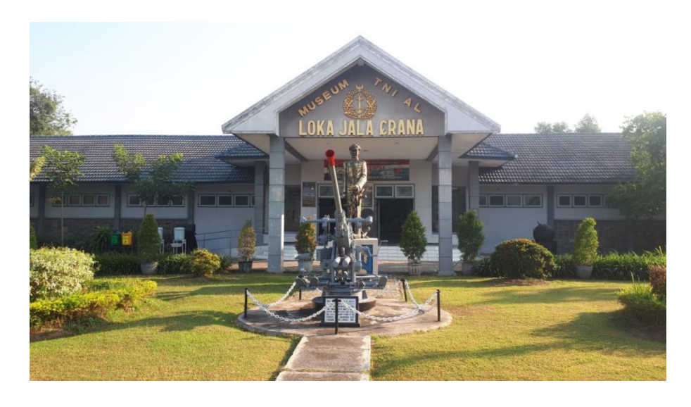
Figure 2. Museum Loka Jala Crana